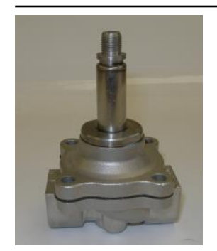
Figure 4: Complete assembly of direct lift diaphragm valve