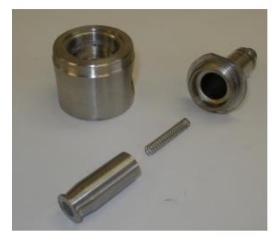
Figure 2: Direct acting valve with all components shown. Debris on the plunger may lead to valve malfunction.